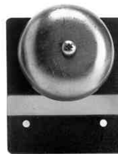
Bracket mount for surface mounting on equipment and controls