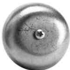
Panel Mount for O.E.M. applications on control panels and/or equipment